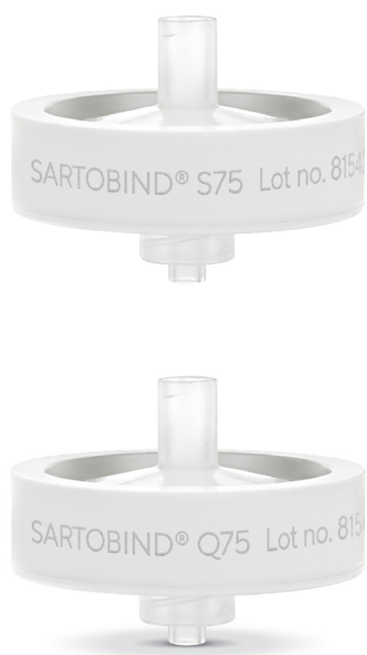
Figure 1: Sartobind® IEX Lab Membrane Adsorbers

Here, we aimed to find the optimal binding conditions and estimate the binding capacity and flow rate of Sartobind® Lab membrane adsorbers (Figure 1) for the phage PR772.