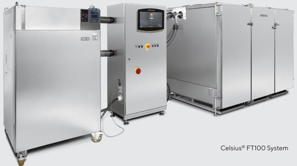
Celsius® FT100 System

Celsius® CFT processes up to 100 L of product per cycle, and offers well-qualified shipping solutions for transferring the frozen drug substances around the world.