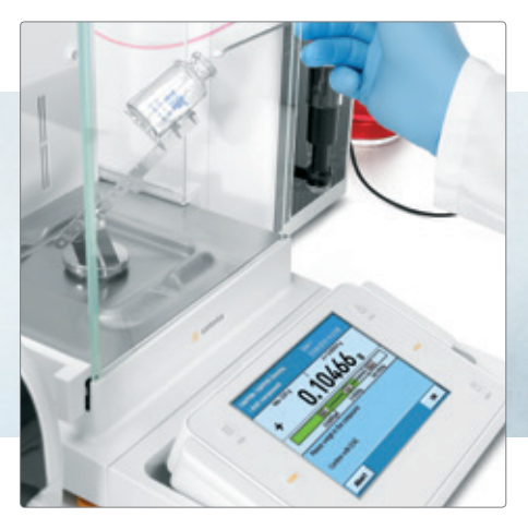
Step 1: Weighing of the compound