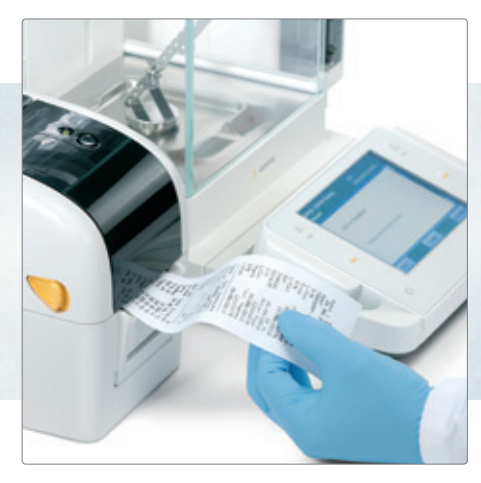
Step 5: Print the results in GLP or label form on self-adhesive paper