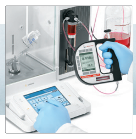
Step 2: Measure the density of solvents