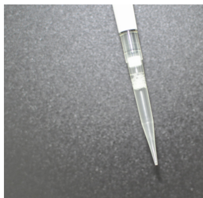
Figure 2. Pipetting BSA solution (1 mg/ml) with slow speed (Picus® 2 setting 1) is gentler on the protein.