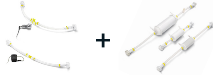
Single-Use Pressure or Flow Pipe + Multi Use Transmitter

Design a complete single-use functional unit!