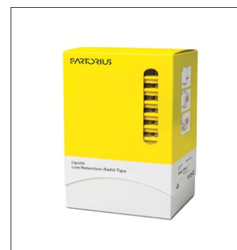
Refill Tower space-saving, ecological refill packages