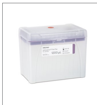
Single Tray racks purity-certified tip racks