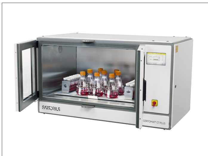
Real-time PCR kit for the specific and sensitive detection of Mycoplasma DNA

A standard DNA extraction followed by a TaqMan® probe real-time qPCR is used for the detection of Mycoplasma DNA. 200 µl to 18 ml sample volume can be used as starting material for the DNA preparation. The isolated DNA is amplified in a qPCR cycler and the evaluation can be performed with the standard cycler software.