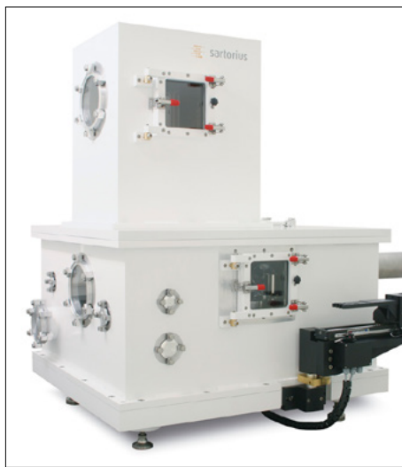
Figure 2: Mass comparator Sartorius CCL1007.

The mass comparator CCL1007 mentioned above was developed by Sartorius in cooperation with the BIPM | France at the beginning of the 2000s, with the aim to determine the mass of 1 kg silicon spheres with the highest possible accuracy through mass comparison. In the first step, the Avogadro constant should be re-determined as part of the Avogadro experiment (see above). For this experiment the mass comparator CCL1007 was and is also used at the PTB (Physikalisch-Technische Bundesanstalt) in Braunschweig, Germany. Following the introduction of the new definition of the SI unit kilogram, it will be possible for national metrology institutes worldwide, such as the PTB in Germany, to use this mass comparator irrespective of the International Prototype Kilogram (IPK) in Paris | Sèvres as a traceable mass scale for the respective nation. Because everything is based on the kg, the mass determination from milligrams to the tonne can thus be realised in the future using SI spheres. It speaks for itself that even at the very highest metrological level Sartorius' know-how and technology are trusted.