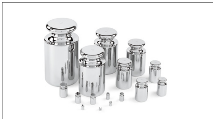
Figure 3: Class E2 knob weights from the "ProofLine" series from Sartorius.

And similarly to the balances, there is no necessity to postpone an intended purchase of a weight to after 20.05.2019.