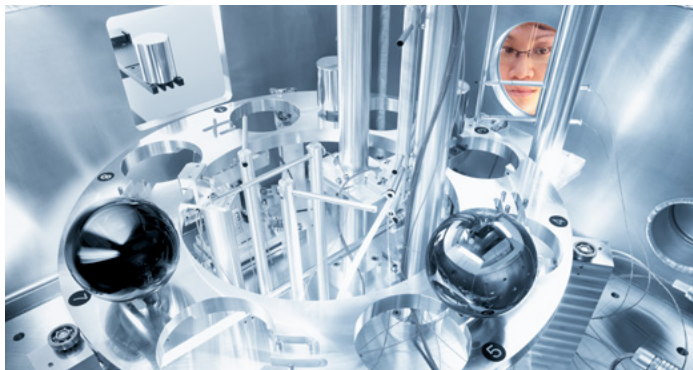
Figure 1: Two copies of a silicon sphere in a specially designed mass comparator from Sartorius.