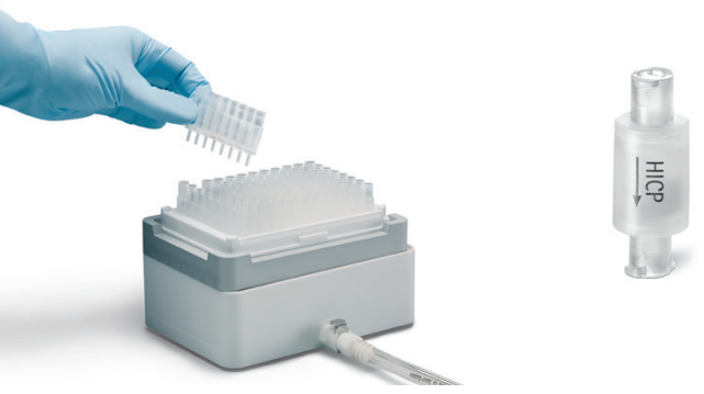
96-well plates | Phenyl pico device 0.08 mL