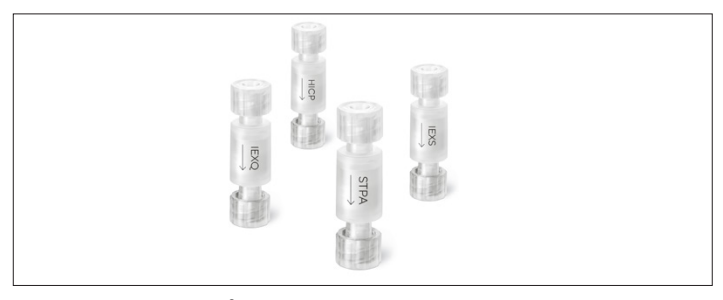
Fig. 1: 4 types of Sartobind® Pico 0.08 mL are available. For the content of the package refer to chapter 9 Ordering Information.

concentration more protein is bound until the protein precipitates. Preferably, the protein binding is performed in the region where the amount of bound protein increases linearly with the salt concentration. Proteins are eluted by decreasing the salt concentration in the elution buffer. Using step or linear gradient elution proteins are eluted in the order of their hydrophobicity. In contrast to HIC, reverse phase chromatography uses ligands in much higher density. This results in higher hydrophobicity: HIC matrices allows more gentle separation conditions in which the molecular structure of the protein is preserved.