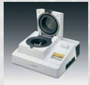
LMA200 – speed meets analytical precision