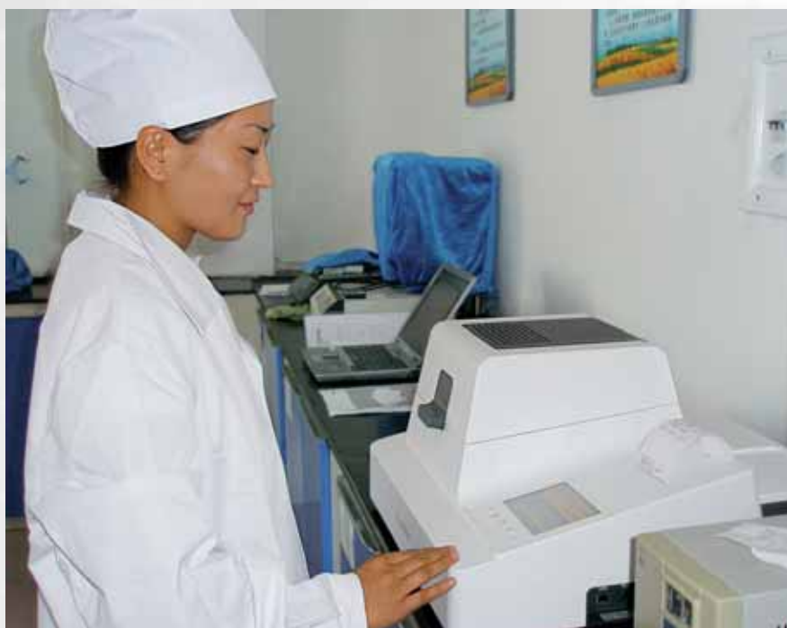
A pleased member of COFCO's laboratory staff who are very satisfied with LMA200

highlighted the LMA200's technical performance features and the services Sartorius could provide. To verify the suitability of the LMA200 and to support COFCO's staff in defining optimal operating parameters, the Sartorius application engineer performed many comparative tests for this customer at our application laboratory in Beijing, Sartorius headquarters in China. In the past, COFCO had to spend about four hours to measure moisture using a vacuum drying oven. However, by using the Sartorius LMA200 moisture analyzer, it now takes COFCO less than two minutes to complete moisture analysis of a sample!